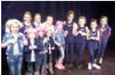
Left: U11 Boys in Solo Disco Dance.