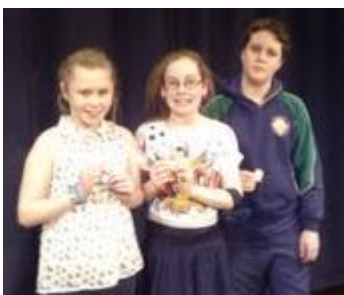
Right: U11 Group Modern Dance.