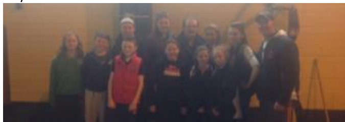
Boxers and coaches pictured after last Sunday's tournament in Kildare.