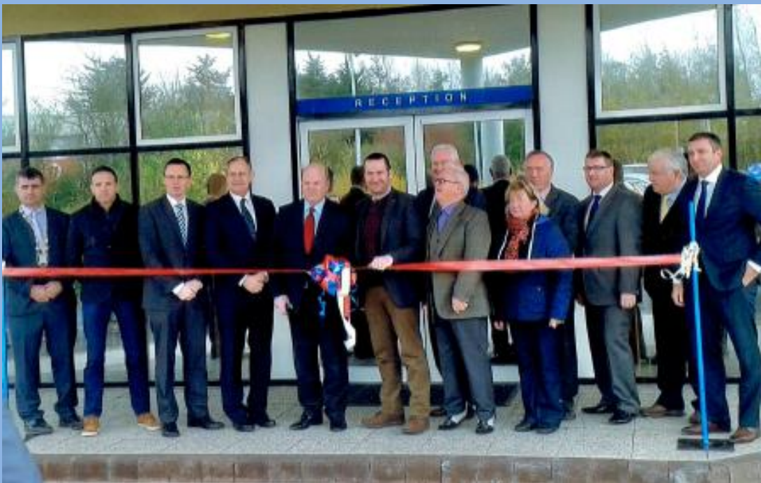
Left: Minister for Finance Michael Noonan T.D. cutting the tape at the official opening of the Enterprise Centre.

Also a section of the building has been taken over by the Butterfly Club who hope to occupy it in 2016.