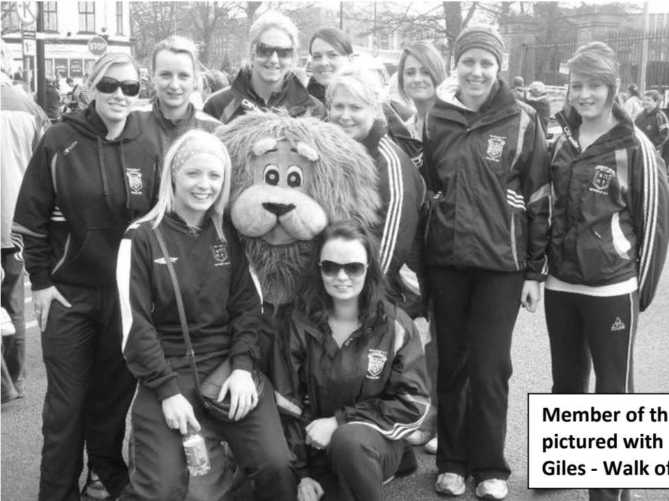
Member of the Rathkeale Ladies Soccer team pictured with Leo the Lion at the 'Johnny Giles - Walk of Dreams' held in Limerick.